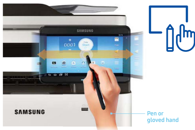
Pen or gloved hand

The Samsung ProXpress C4060FX comes equipped with an interactive 7-inch IR type touchscreen panel to access the Smart UX Centre. The touchscreen is simple to use and enables users to easily move widgets and apps around, even when operating with a pen or gloved hand.