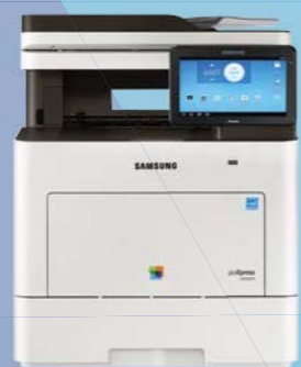
C4060FX (up to 40 ppm*)

*Print and scan speeds may vary depending on a number of factors including (but not limited to) document type, document size, document condition, network conditions and print settings. Print quality may depend on content.